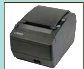
UP-360 Thermal Printer