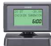
External Remote Display