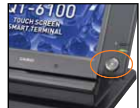
Optional Dallas Key – Server Sign-on & Macro Activation